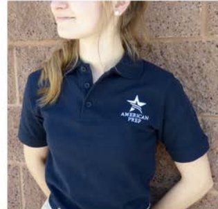
POLO WITH STAR LOGO $15