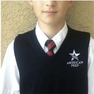
VEST W/WHITE STAR LOGO $25