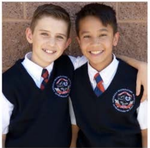
VEST W/ CREST LOGO $25