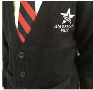
V-NECK CARDIGAN W/ STAR LOGO $30