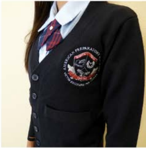
CARDIGAN W/CREST LOGO