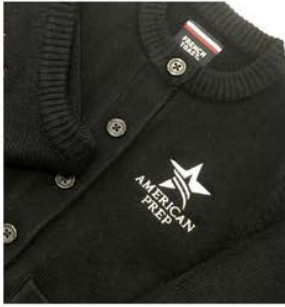
ROUND NECK CARDIGAN $30