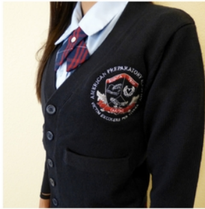
CARDIGAN W/CREST LOGO