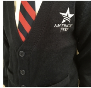
V-NECK CARDIGAN W/ STAR LOGO $30