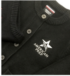
ROUND NECK CARDIGAN $30