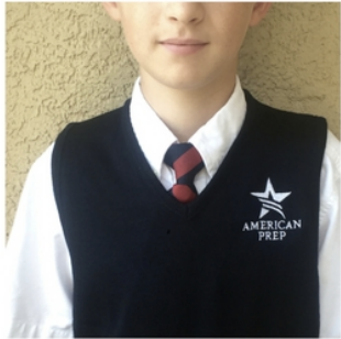
VEST W/WHITE STAR LOGO $25