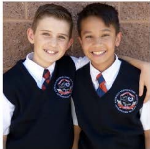
VEST W/ CREST LOGO $25