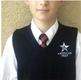
VEST W/WHITE STAR LOGO $25