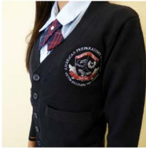
CARDIGAN W/CREST LOGO