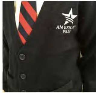
V-NECK CARDIGAN W/ STAR LOGO $30