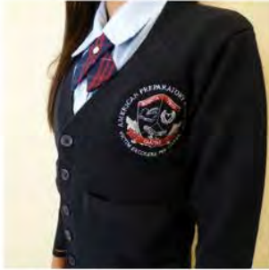
CARDIGAN W/CREST LOGO