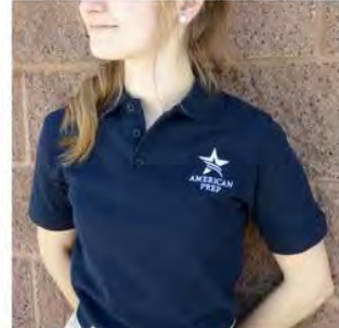
POLO WITH STAR LOGO $15