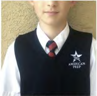
VEST W/WHITE STAR LOGO $25