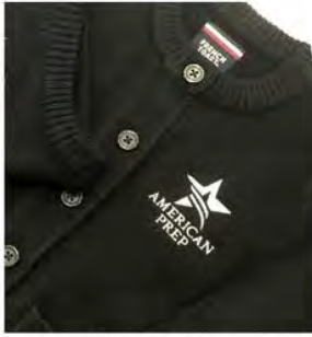
ROUND NECK CARDIGAN $30