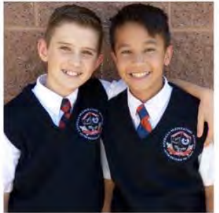
VEST W/ CREST LOGO $25