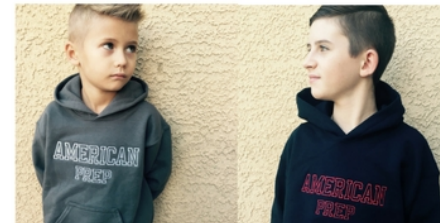
EMBROIDERED HOODIE Gray/White OR Navy/Red $30