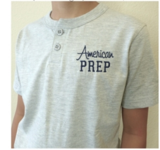
HENLEY W/ EMBROIDERY All Sizes $20