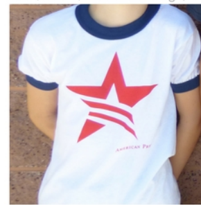
RINGER T-SHIRT All Sizes $15