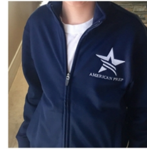
FULL ZIP JACKET Youth, Unisex, and Ladies Sizing $40