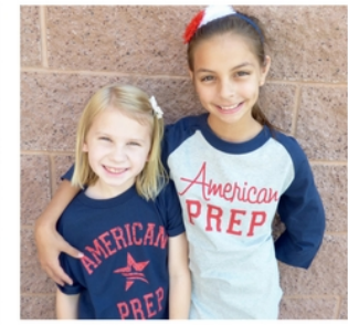
BASEBALL T-SHIRT (shown right) All Sizes $20