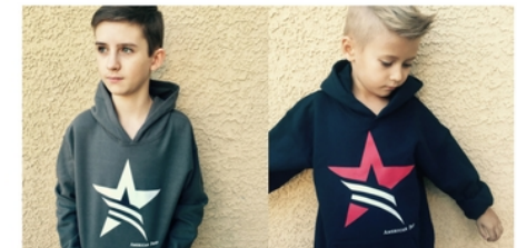
STAR HOODIE Gray OR Navy w/ Star Logo $25