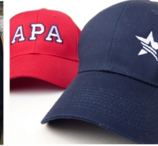
APA BALL CAPS Youth and Adult Sizes $15