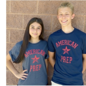
CLASSIC TEE All Sizes $15